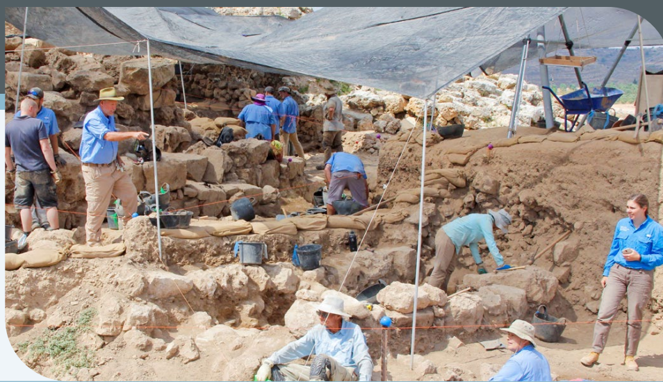
Fig. 2. Excavations at Tell Shiloh