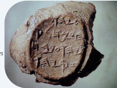
Fig. 3. Bulla of a Judean minister

method too holds great potential, as it improves the findability of tiny items such as clay bullae, whose relevance may have a major chronological impact that should not be underestimated. The archaeological sites discussed are early Jerusalem, Ai of the conquest period and Shiloh, whose role as cultic center rose to prominence during the period of the Judges. An archaeological exhibition will accompany the program.